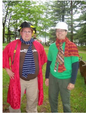
Official Cabin Inspectors, Luther Park 2008